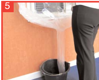
5 ...making sure the drain tube discharges into a suitable container.