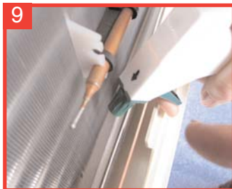
9 Clean the drain tray as required by spraying with AC-OK if accessible.