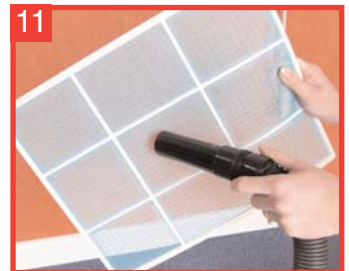
11 Clean the filter with a vacuum cleaner, reassemble the unit, plug in and switch on.

No need to rinse. Used product and contamination will drain away as normal. Continue cleaning until the product run-off from the coil is clear.