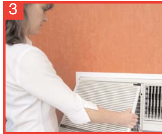
3 Open the air inlet louvre.