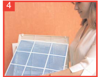
4 Remove all filters (primary, and secondary if present).