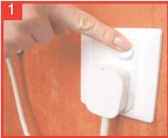
1 Switch the unit off ...

will ensure that the indoor part of your air conditioning system is clean. Please read this sheet and all labels carefully before using the product. We recommend that an A/C unit is cleaned at least twice a year at six monthly intervals.