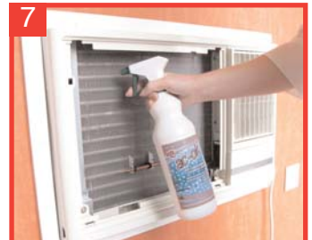
7 Work down and across in a methodical manner. Keep Sprayer head within 5cm of the coil.