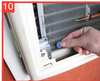
10 Place an AC-OK Treatment Tablet in the condensate tray, if accessible.