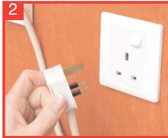
2 ...disconnect from the electrical supply