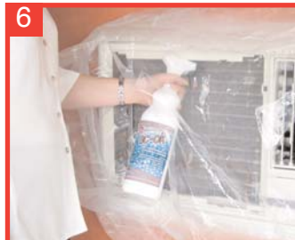
6 Spray AC-OK into the coil starting at the top in a corner.