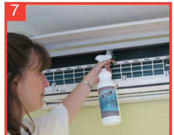
7 Work down and across in a methodical manner. Keep Sprayer head within 5cm of the coil.