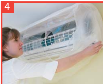
4 Place and fix an AC-OK Cleaning Cover around the unit...

Please cover any furnishings/electrical equipment that may be damaged during the cleaning process. Or use an AC-OK Cleaning Cover ..