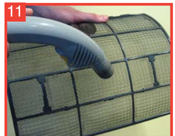
11 Clean the filter with a vacuum cleaner, reassemble the unit, plug in and switch on.

No need to rinse. Used product and contamination will drain away as normal. Continue cleaning until the product run-off from the coil is clear.