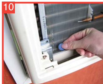
10 Place an AC-OK Treatment Tablet in the condensate tray, if accessible.