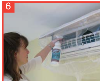
6 Spray AC-OK into the coil starting at the top in a corner.