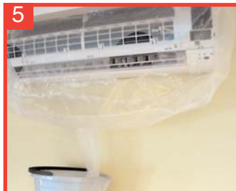
5 ...making sure the drain tube discharges into a suitable container.