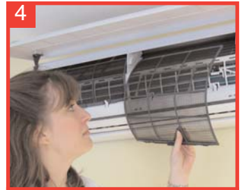
4 Remove all filters (primary, and secondary if present).

Please cover any furnishings/electrical equipment that may be damaged during the cleaning process. Or use an AC-OK Cleaning Cover ..