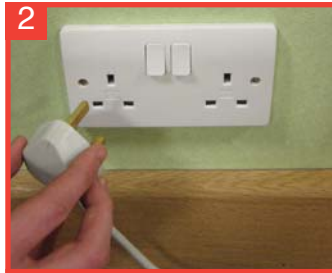
2 ...disconnect from the electrical supply