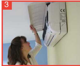
3 Open the air inlet louvre.