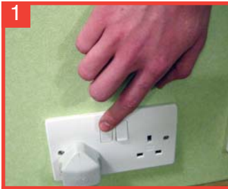
1 Switch the unit off ...

The A/C-OK System for indoor coils will ensure that the indoor part of your air conditioning system is clean. Please read this sheet and all labels carefully before using the product. We recommend that an A/C unit is cleaned at least twice a year at six monthly intervals.